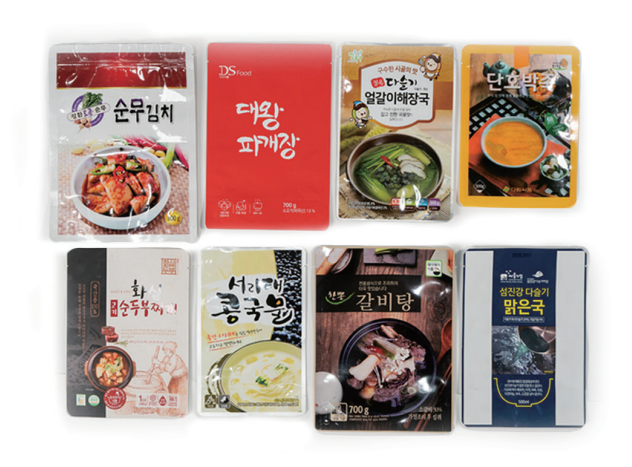
Standing Three - Way Pouch