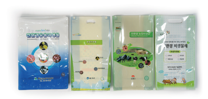
Standing Nbang Pouch (for 2–5 L)