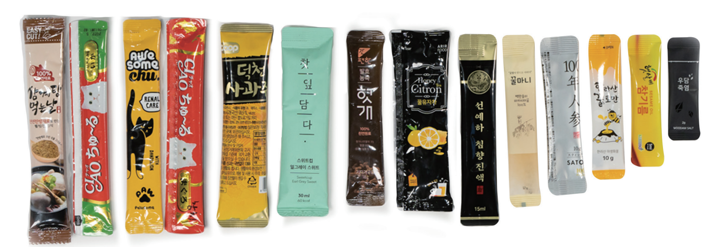
Stick, Liquid, Powder